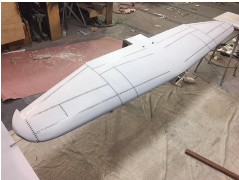
P-47 Wing, Rivets and Panel Lines Ready to Prime