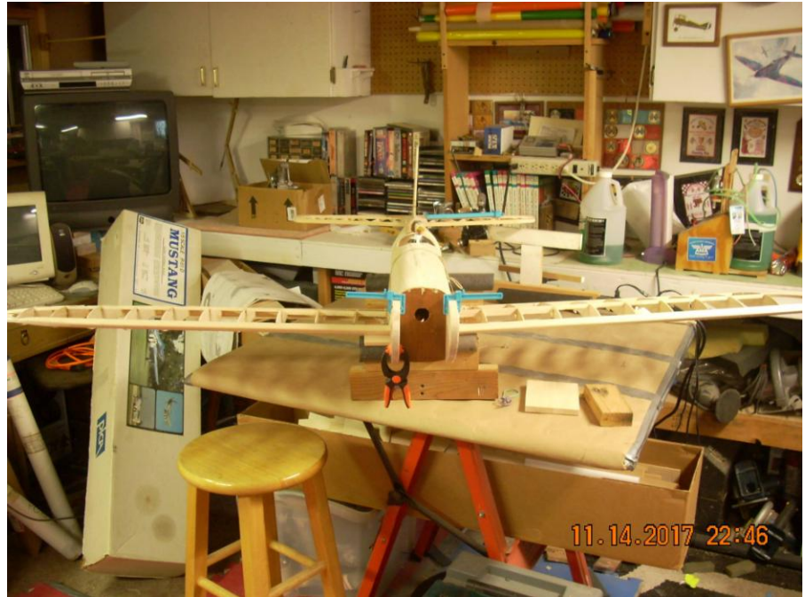
Chick Fosters HOG