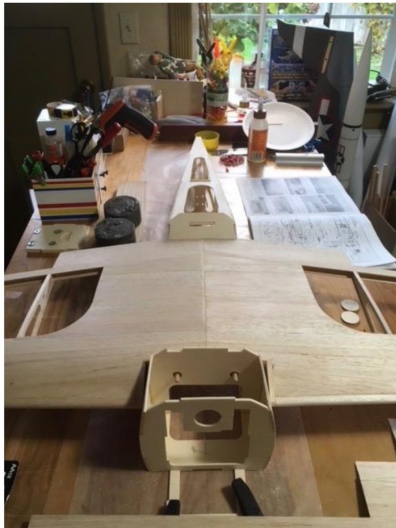
Jeff Lutz's Extra 300