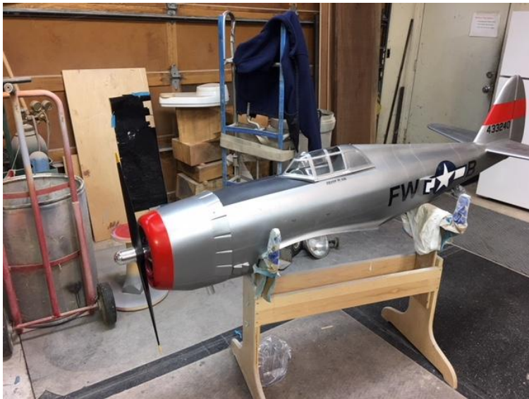
Franks P-47 Fuselage Painted