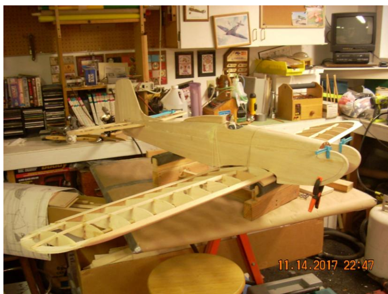
Chick Fosters Hog